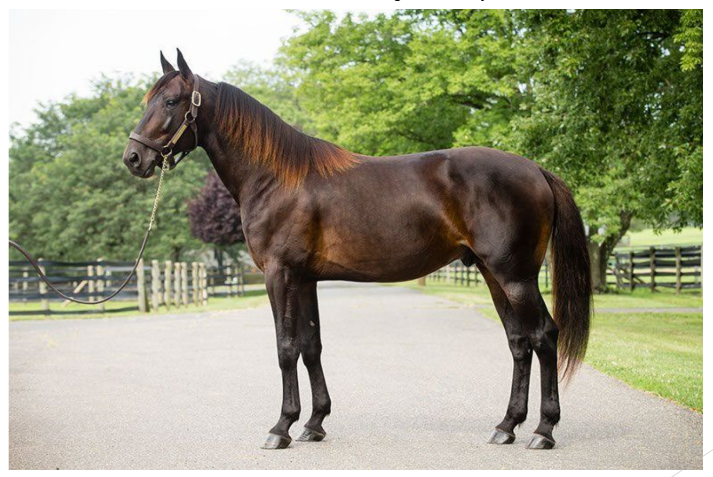
STANDING AT SOUTHWIND FARM www.southwindfarms.net

A winner of 9 of 10 career starts, including 7 of 8 at two, highlighted by the Breeders Crown (elim and Final), Kindergarten Final and the International Stallion Stake at The Red Mile, trotting to his two-year-old World Record of 2,1:51.3.