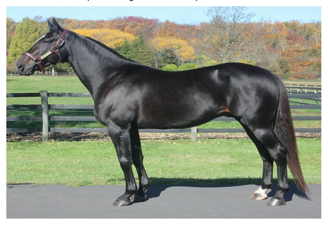
STANDING AT SOUTHWIND FARM www.southwindfarms.net 2023 Fee $15,000

Bay 2015 • Muscle Hill – Southwind Serena – Varenne In 2018 at three, winner of his elimination and $500,000 Final of the Breeders Crown, the $350,000 TVG Trot Final, Bluegrass Stakes, an elimination of the Hambletonian, an elimination of the Kentucky Futurity, and a leg of the Kentucky Sires Stakes.