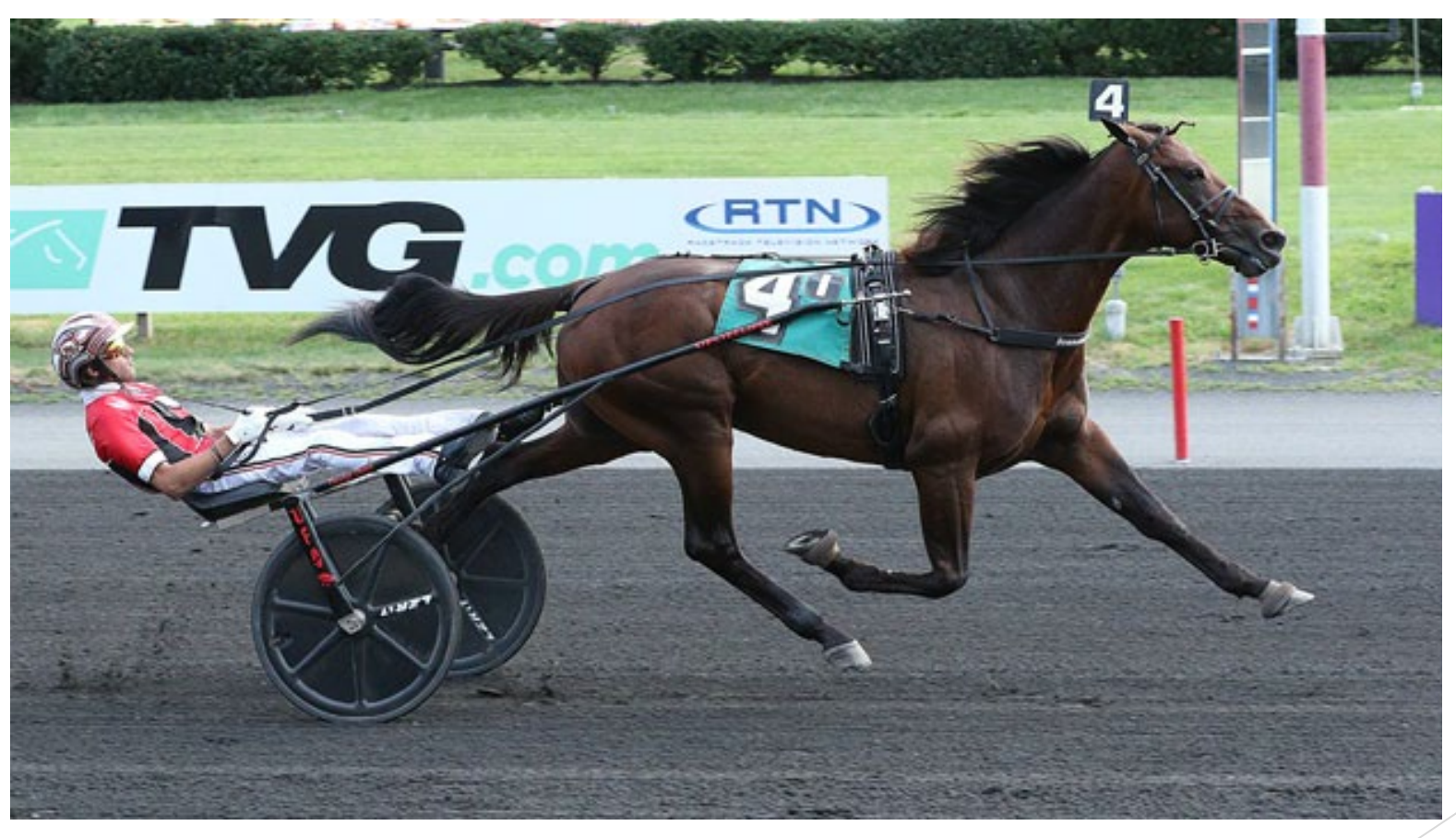
STANDING AT WALNRIDGE FARM www.walnridgefarm.com 2023 Fee $7,500

The winner of $1.5 million lifetime, winning 16 of 37 lifetime starts.