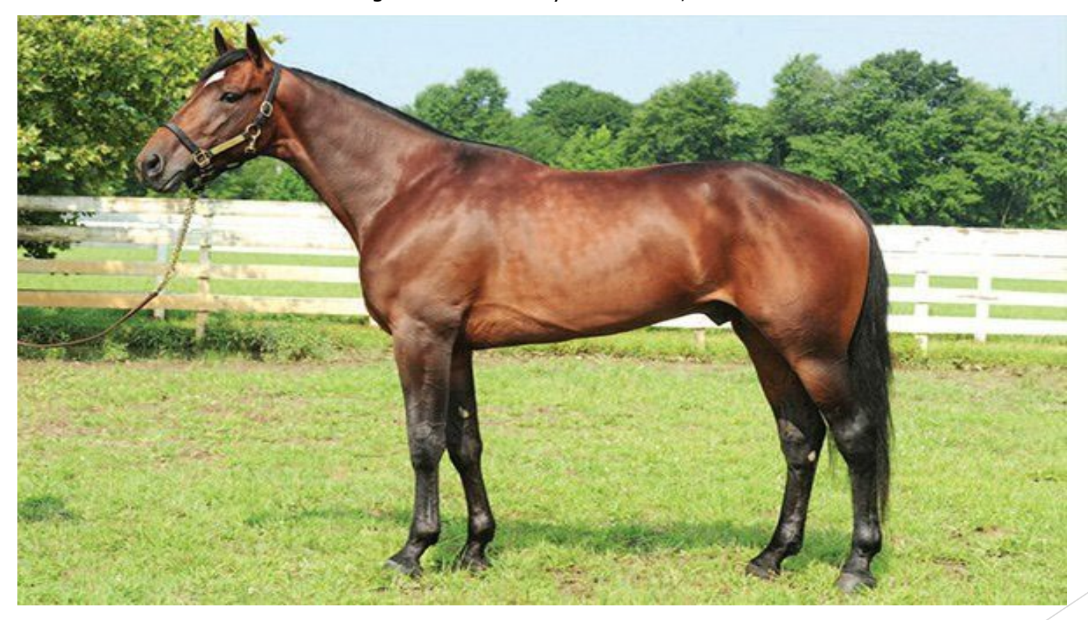
STANDING AT SOUTHWIND FARM www.southwindfarms.net Book Full and Closed

The #1 trotting sire, he led in all-age money-earnings again in 2020, with the winners of over $9.6-million. He has been the leading sire for the fifth year in a row, from 2016 to 2020.